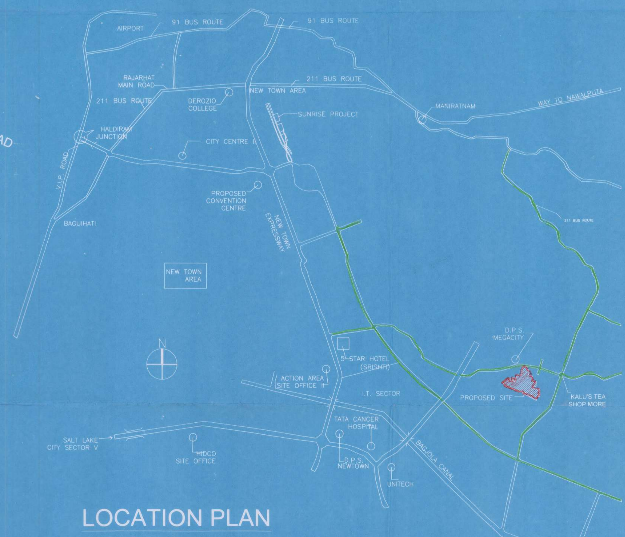
LOCATION PLAN 1:6000

GENERAL NOTE 1. ALL DIMENSIONS ARE IN MM. 2. THE DIMENSIONS SHOWN IN THE FOLLOWING: A. ALL INTERNAL WALLS ARE OF 200MM THK. ALL BLOCK AND EXTERNAL WALLS ARE 300MM THK. WALLS. B. ALL WORK TO BE DONE ON BOTH SIDES OF EXTERIOR WALLS AND THE FOUNDATION. 3. THE UPPER FLOOR DRAWING IS SO DESIGNED THAT IT IS CAPABLE OF TAKING THE LOAD OF HEAVY VEHICLES OVER THE TERRACE. 4. ALL THE RECOMMENDATIONS OF M.O. OF TOWN, FIRE SERVICES, LOCAL AUTHORITY, MUNICIPALITY, SHALL BE STRICTLY ADHERED TO IN THIS PROJECT. 5. BOTH DRAWINGS ARE INTERDEPENDENT.